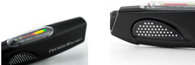
(Click to Enlarge Image) (Click to Enlarge Image) 180° multi viewing display Ergonomic grip